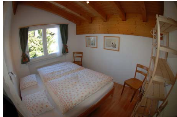
smaller Double Room