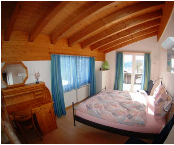
Parents Double Room