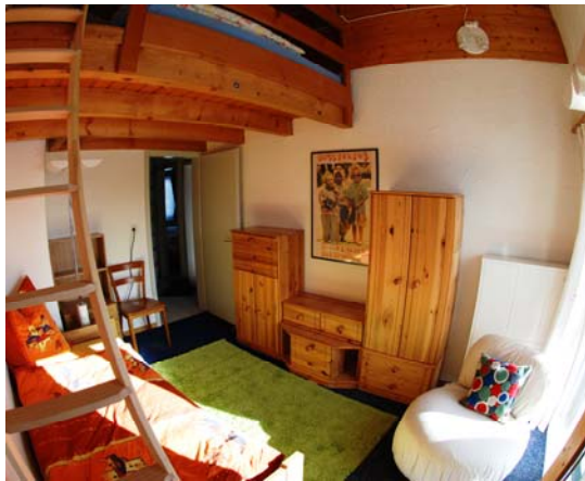
Galerie Room with Single Bed