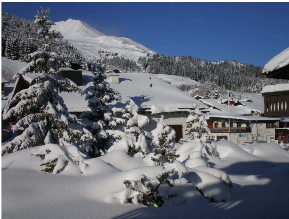
Panoramic View direction Alp Stätz Ski Slopes