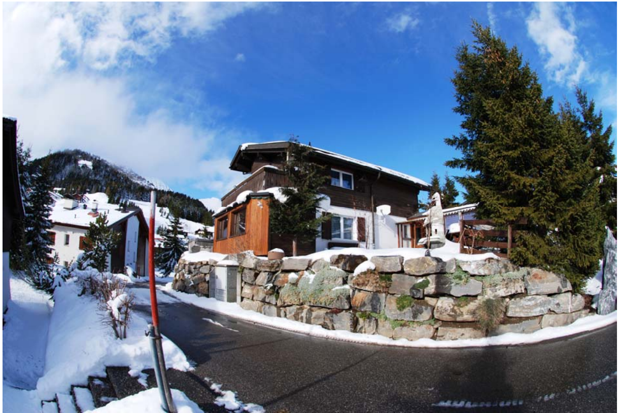
Casa Hofer Sartons